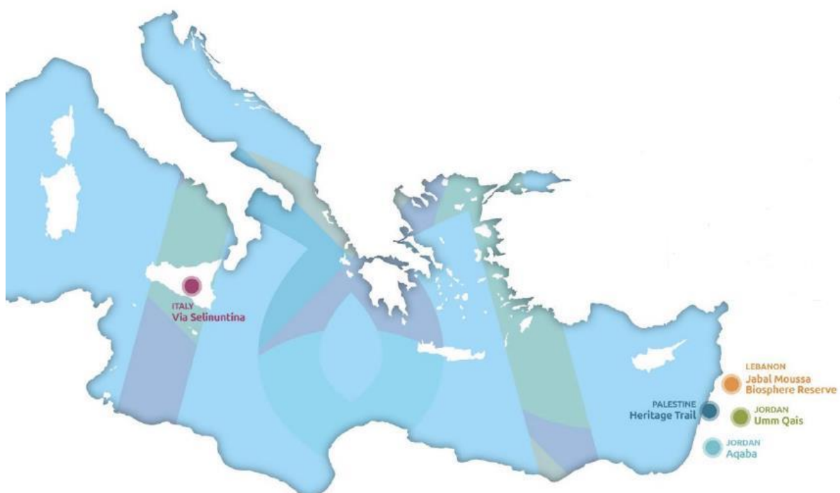
Figure 1 – Targeted destinations